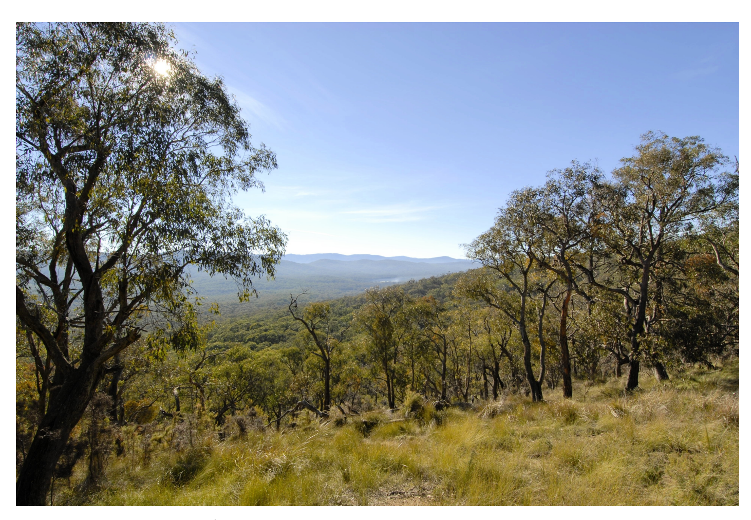
Bunyip State Park has many beautiful views to discover