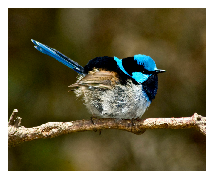
Keep your eyes open for some of the smaller wildlife including the beautiful blue male Superb Fairy Wren