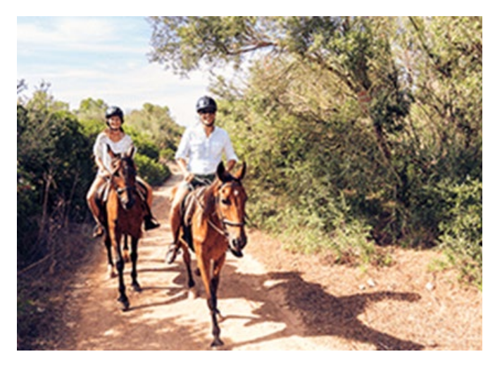
Enjoy nature from a different viewpoint