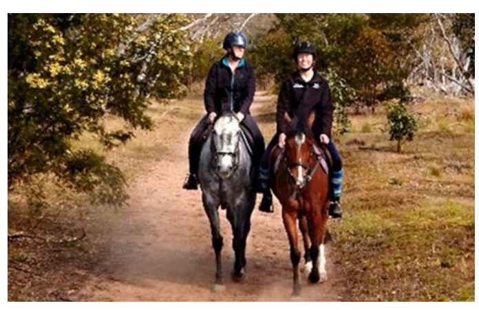
It is safer to ride with someone else

There are a number of shorter tracks and routes in the park, most accessed from the Cannibal Creek Unloading Area. Half a dozen trail loops cover the south-west section of the park. Enjoy a wide variety of vegetation and landscapes while benefiting from outdoor exercise. See map overpage for details.