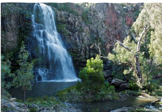
Snowy River National Park.