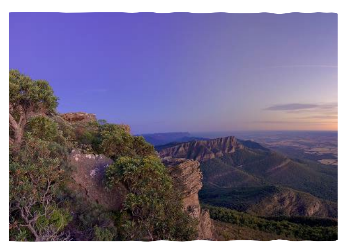
Grampians (Gariwerd) National Park.

Before proceeding to the application stage, use the following checklist to ensure you have all the required information. As part of the application process, you will be asked for all the following information.