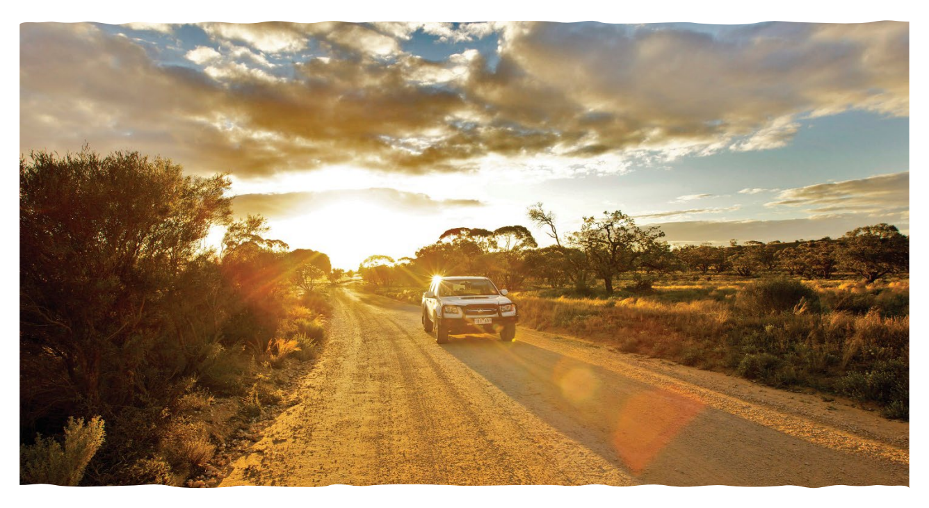
Murray Sunset National Park

Tour Operator and Activity Provider legislation, regulation and policy has been developed and is maintained by the Department of Energy, Environment and Climate Action (DEECA). You can find additional licensing details such as Policy Statements and Fact Sheets by visiting <a href="mailto:forestsandreserves.vic.gov.au/tour-operators">forestsandreserves.vic.gov.au/tour-operators</a>.