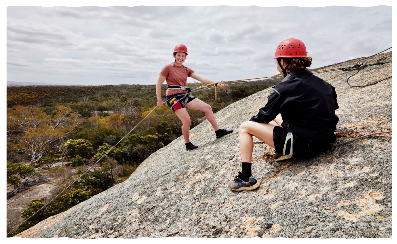
You Yangs Regional Park.